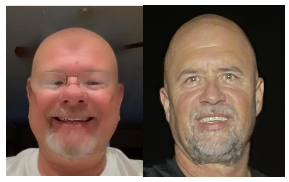
<u>OR</u> Maybe I'll try this in October!

Well with this heat wave I thought I would try a little something different to help stay cool and catch more fish. What do you think? I hope your laughing Tim or I'm in real trouble!