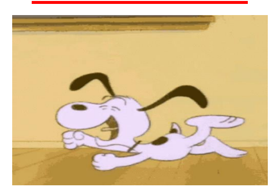
Ken's hot streak is over!!