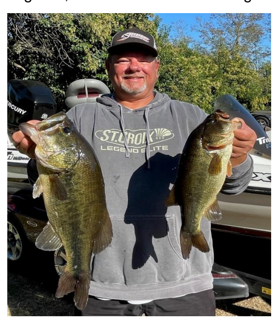
Page 4 of 13

Bill had a 5-pound lead going into Day 2. But, Day 2 wasn't so good for Bill as his punch fish dried up and the mats, he had been fishing had been compressed by the heavy winds the night before. This made it very difficult to break through the vegetation with anything short of a 2-ounce weight. To get a limit on Day-2 he had to abandon everything from Day-1 and go throw a senko for a 7-pound limit on the main channel of the Mokelumne between Sycamore and Hog. But, that 7 lbs. limit was enough to hang onto the win.